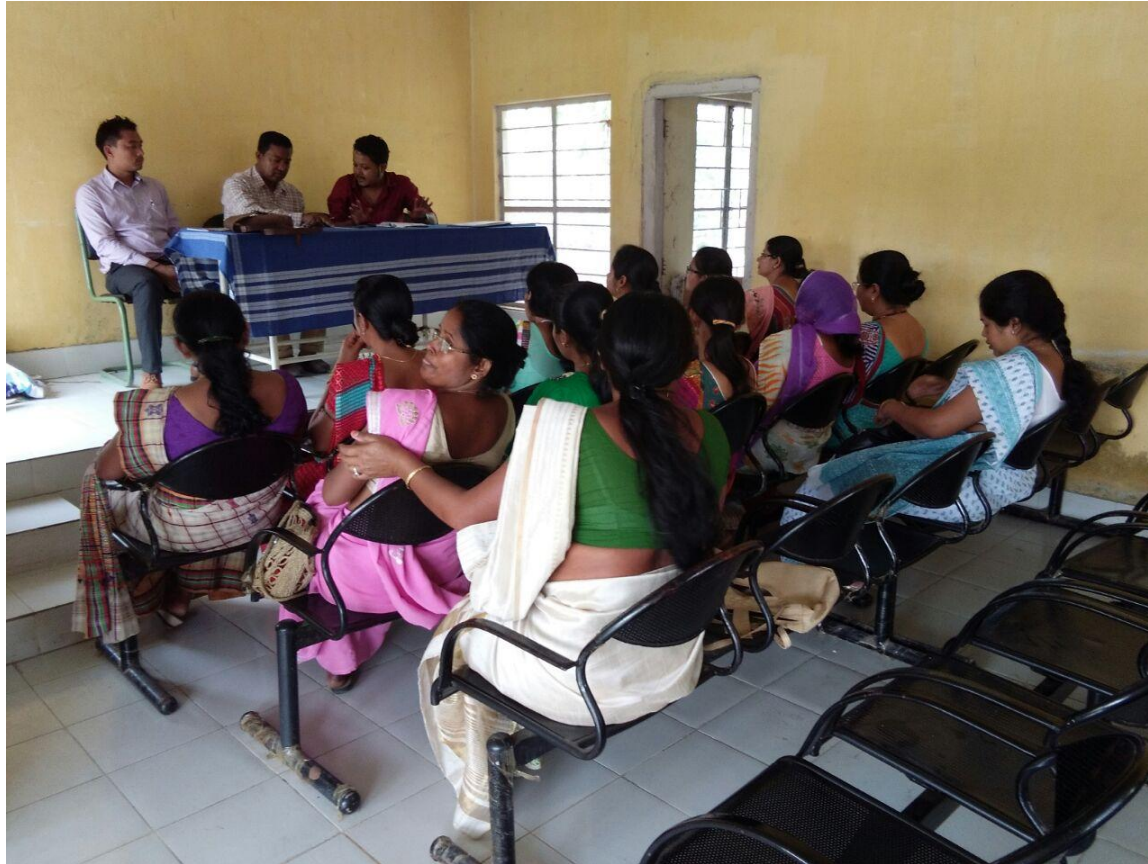
Attending review meeting of ASHA supervisors in presence of SD&MO Dholpur block & DCM of Lakhimpur District