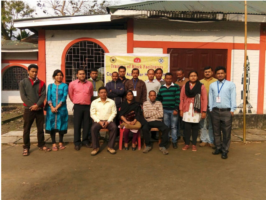
Zonal training of CAH Team for Lakhimpur & Dhemaji Districts