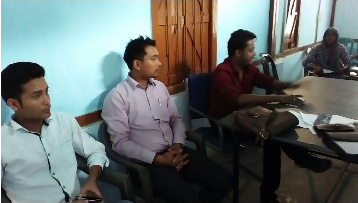
Attending meeting of ASHA supervisors, accompanied with DCM Lakhimpur, and Block Facilitator of Bhipuria