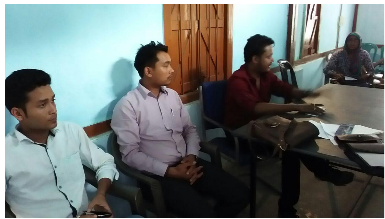
Attending meeting of ASHA supervisors, accompanied with DCM Lakhimpur, and Block Facilitator of Bhipuria