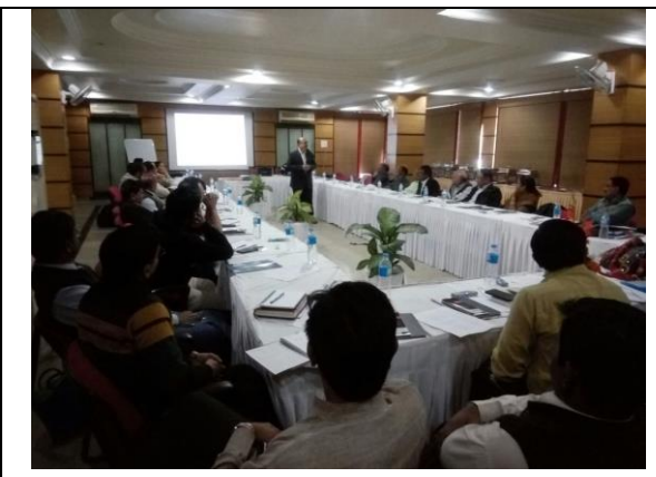
ToTs in progress for DCMs, DPMs and Regional Directors

The community action for health process has been re-initiated in five 'intensive community monitoring' districts: Barwani, Betul, Bhind, Chhindwara and Sidhi. Training of Trainers (ToTs) for district community mobilisers, district project managers and members of Mentoring Group for Community Action (MGCA) were organised. To gear up the people at the key positions, chief medical and health officers (CMHOs) were oriented, which was resulted a push in approach from the administrative side.