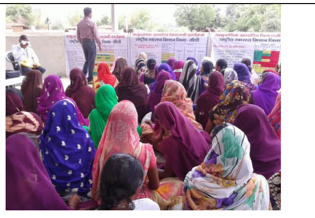
Sharing of reports with community