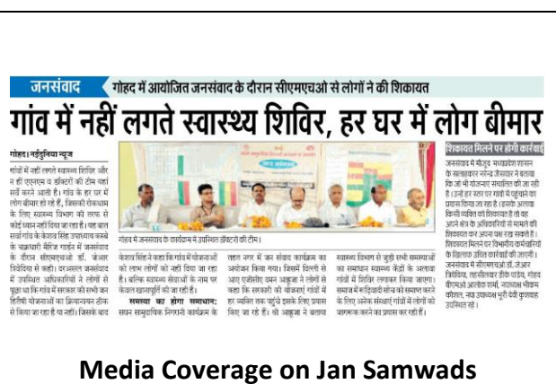
Media Coverage on Jan Samwads

Community enquiry processes in the five intensive community monitoring districts were completed. Subsequently, 15 Jan Samwads were organised in these intensive districts in September 2016. AGCA co-facilitated Jan Samwads in three districts. Later on, two more districts: Agar and Chhattarpur were added in the intensive districts.